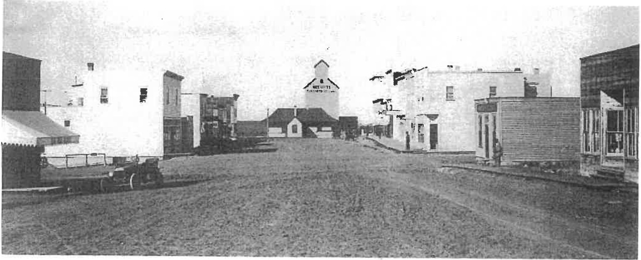
Main Street Loverna.

Approved by Council – February 15 th , 2022 Review Date – February 2026